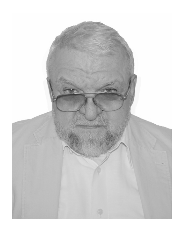
UTOPIA not for primitive